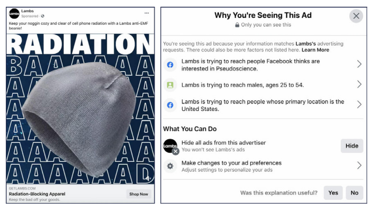
The Markup found an ad for a hat that claims to protect people's heads from cellular radiation. Concerns about electromagnetic radiation emitted by the 5G mobile phone infrastructure are part of the conspiracy theories related to the Coronavirus disease. By clicking "Why are you seeing this ad?" Facebook showed that the advertising company wanted to reach people who may be interested in pseudoscience.3

an option for the purchase of targeted ads, which could ultimately impact publicity around COVID-19.86