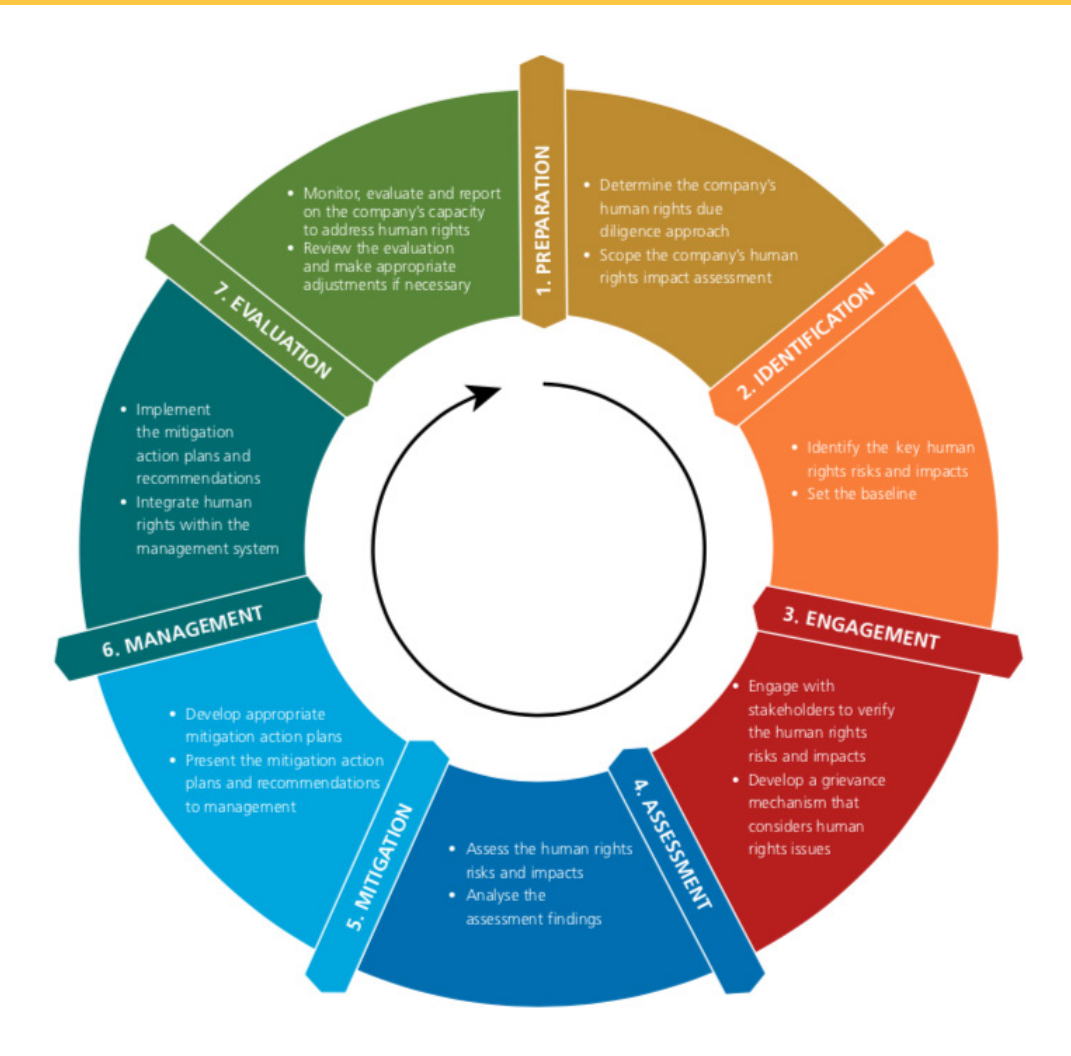
Stages model from Abrahams and Wyss's Guide (2010: 12)

The main characteristics of these stages are the following: