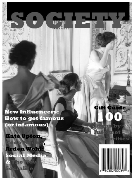
Figure 1. Examples of Final Project Magazine Covers, December 2012.