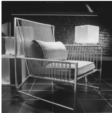
Figure 5. The Partner Lounge Chair (2002), designed by author, welded and caned in NYC. Source.