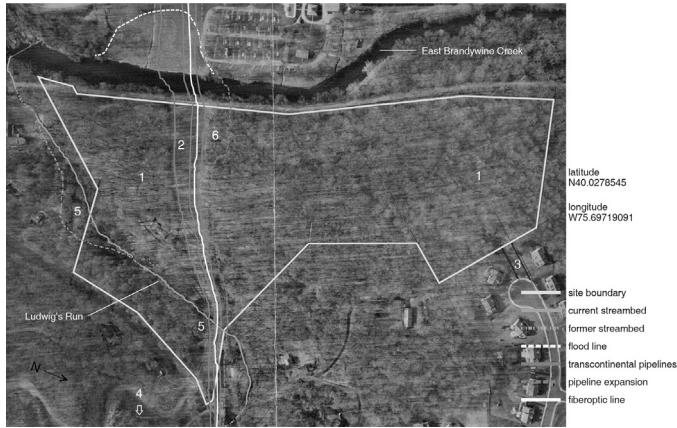
Figure 3. An ecological land-planning project for a 31.5 acre site offered an object-lesson in the benefits of applying historical research methods, such as the close-reading of a text or artifact, to surface indicators of a body or site.