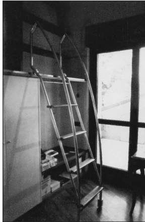
Figure 4. Rolling metal stair (1991), designed by author; installed in Varese, Italy.

visit him at his studio. While sustainable improvements often focus on downstream by products of production, close readings can be performed upstream in the manufacturing sequence, enhancing the wellbeing of fabricators and the poetics of a product.