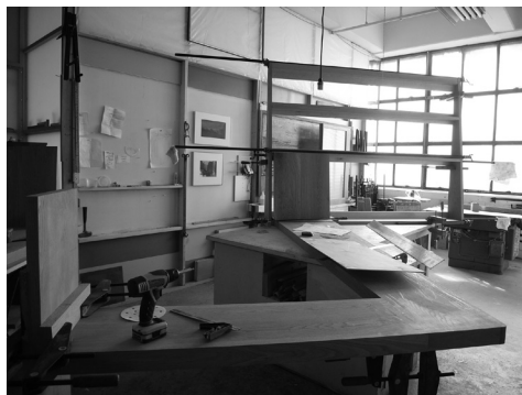
Figure 6. In-progress large-scale furnishings for Milstein-O’Connor residence (2010), designed and photographed by author. Fabricated by Fabio Salvatori in his Brooklyn Naval Yards studio. Source. Author’s.