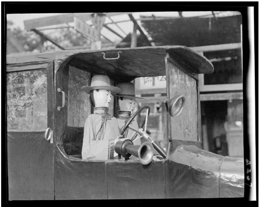
Figure 7. Funeral car, chauffeurs.

Scheppe (2016) reminded the reader that “Confucius recommended the sacrifice of representations of things rather than the things themselves as an acknowledgement of the essential difference in the needs of the incorporeal beings” (p. 57). The fact that they are “devoid of usefulness is why it is fitted to the religious practice and the transfer to another world” (Scheppe, 2016, p. 57). Thus, the logo became emblem of holiness.