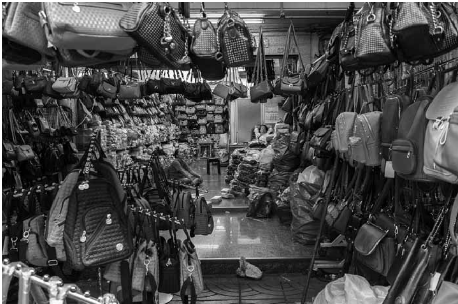
Figure 4. Boredom. Guangzhou, China July 2017.

Today, hundreds of giant hyper-malls all over China are connected to the distribution of fake “stuff.” These commercial emblems have become an integral part of China’s visual and social landscape. The quantities of fake goods using Western brand images (e.g. logos, symbols, and language) has grown for centuries to become an abstract superstructure of falsely branded lifestyles and design integrity. For example, in a Beijing mall where all garments are sold for less than $50 USD each, the decor consists of crystal chandeliers, shiny marble, and mirrors; these overt indications of luxury are important to social status –and shoppers. The aesthetic of the store’s environment is of high interest in the context of this research because it lends a form of prestige and exclusivity to the fake goods.