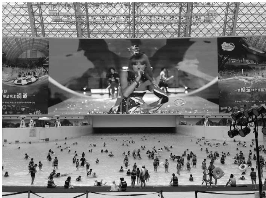
Figure 1. New Global Center, Taylor Swift, August 2016.

In the early 1990s, the traditionally discreet Chinese population suddenly became outspoken through “cultural” t-shirts (Wu, 2009). Printed Chinese characters featured messages such as: “Only my mom is best in this world”, “My future is not a dream”, and “A peaceful life for all good people”. Other t-shirts were more rebellious and conveyed messages such as, “I only follow my feelings” and “Getting rich is all there is.” As this fashion trend began to turn into a broader national trend, the government issued “emergency regulations” and formally banned the manufacture and sale of “unhealthy” cultural shirts in Beijing. The news promoted mottos such as “Study hard and make daily progress” and “I must train myself for the construction of the motherland” (Wu, 2009). In January 2018, China announced the ban of hip-hop culture and tattoos from all media sources (Pasha-Robinson, 2018). Gao Changli, the publicity department director at the State Administration of Press, Publication, Radio, Film and Television of the People’s Republic of China promoted regulations such as “Absolutely do not use actors who are tasteless, vulgar and obscene. Absolutely do not use actors whose ideological level is low and have no class. Absolutely do not use actors with stains, scandals and problematic moral integrity” (as cited in Pasha-Robinson, 2018).