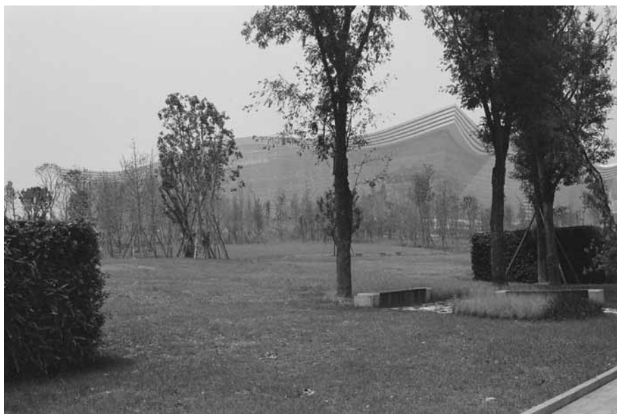
Figure 3. New Century Global Center, Exterior Landscape, Chengdu, August 2016.

China continues to invest in bigger, grander environments for consumption. Some of the largest buildings in the world are located in China. Chinese investors spend tremendous sums of money on erecting giant retail complexes for shopping and entertainment. For example, The New Century Global Center, developed by billionaire Deng Hong's Entertainment and Travel Group based in Chengdu, was created to be less about material consumption and more about experiences. The Center is a place to meet friends, go to video arcades, see a movie, eat, swim, skate, and sing karaoke. The giant space also offers offices, conference rooms, a university complex, two commercial centers, hotels, an IMAX cinema, a Mediterranean-styled "Village", a pirate ship, a church, and a skating rink. The Center's premier feature is a water park named "Paradise Island Water Park" that contains a 5,000 m 2 (54,000 square feet) artificial beach where a giant 150 by 40 m (490 by 130 ft) screen forms an artificial horizon to replicate sunrises and sunsets. At night, a stage extends out over the pool for concerts. The New Century Global Center is ranked as the number-one building with the largest floor area in the world, containing 1,760, 000 m 2 (18,900,000 square feet) of floor space, followed by Dubai International Airport's Terminal Three.