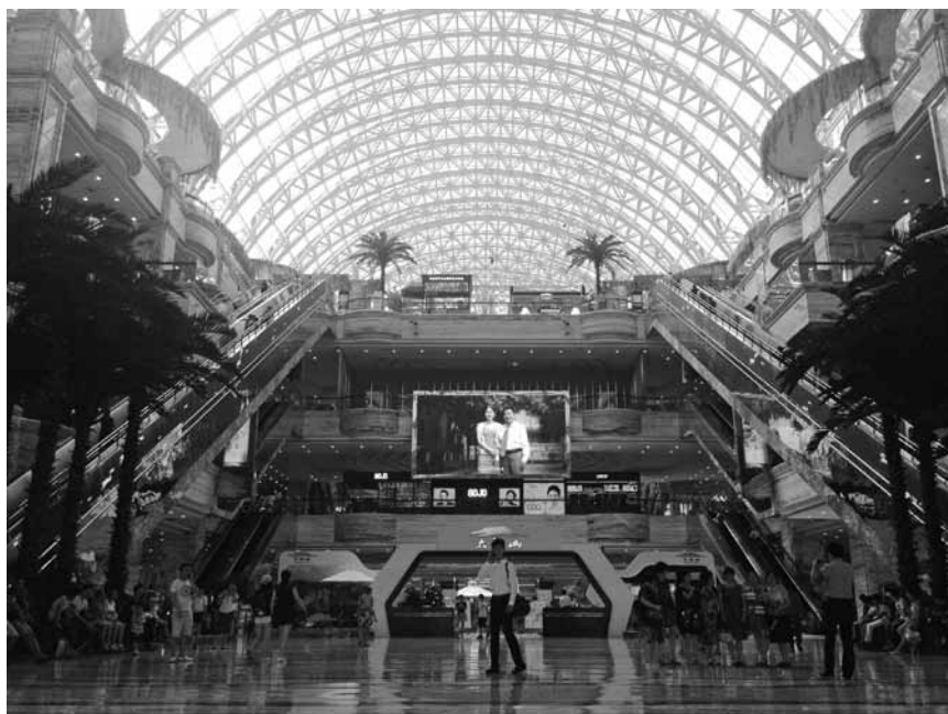
Figure 2. New Century Global Center, Luxury Mall Interior. Chengdu 2016.

In Asia, the concept of "luxury" is still mostly embedded in objects or goods. Banta's (2017) research found that "throughout early historic periods, the Chinese have shown their conspicuous display of wealth and power through material objects. Most notably through the use of gold, ornate jade, and gilded objects" (n.p.). Today, luxury goods are conspicuously displayed at social gatherings, business meetings, and even a date. To the Chinese, luxury still revolves around identity and status symbols.