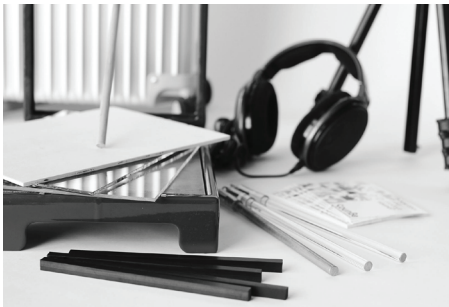
Fig. 3 - SounBe tool: a zoom view