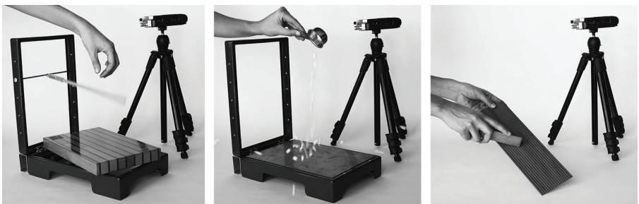
Fig. 4 - Some examples of the different solicitations currently possible by using SounBe tool