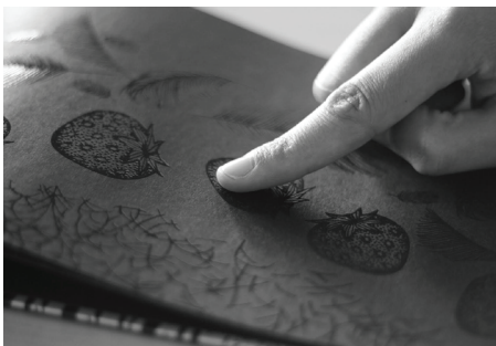
Fig. 2 - Feeling the textures of a product